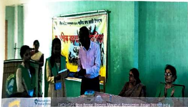
FHC&CP1 Borj Bazar, Borj, Majuli, Bongaigaon, Assam 783308, India