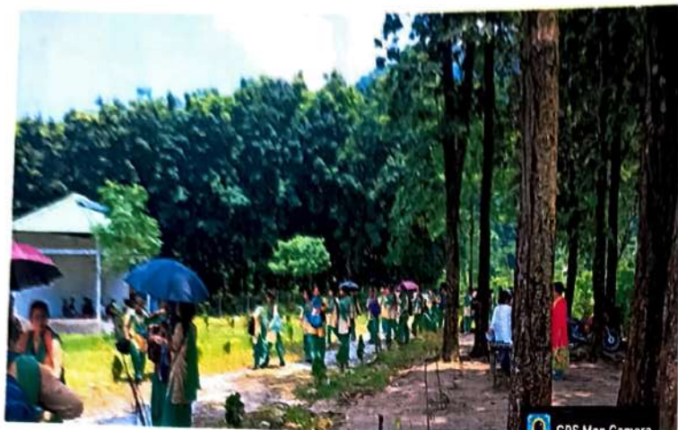
GPS Man Camera

Environment Protection Cell of Birjhora Kanya Mahavidyalaya organised an Environmental Field Trip on 16 th July, 2022 at Raja Thakur, a Mythologically and Bio-diversitically rich place situated at the foothill of Bhumeswar Hill and Biodiversity Park (Sahitya Manishi Upobon) situated at Chitkagaon Aie Valley division (Kakoijana Reserved forest). Three Hundred Twenty Eight (328) students of B.A. 2nd semester and Eighteen (18) teachers of Birjhora Kanya Mahavidyalaya participated in this trip. After reaching the spot the students accompanied by the teacher supervisor observed and studied the Bio-diversity of both the places and noted down the important observations.