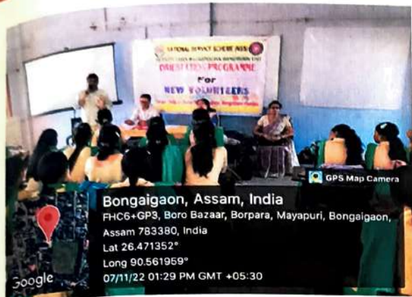
Bongaigaon, Assam, India FHC6+GP3, Boro Bazaar, Borpara, Mayapuri, Bongaigaon, Assam 783380, India Lat 26.471352° Long 90.561959° 07/11/22 01:29 PM GMT +05:30

The NSS unit of Birjhora Kanya Mahavidyalaya conducted an Orientation program on 7 th November 2022 for Special Camp held in the adopted village. The volunteers were informed about their duties and responsibilities in the camp and taught how to make survey to find out the socio-economic conditions of the villagers. In this programme the volunteers were motivated to make the programme a grand success.