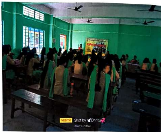
2022/11/21 11:41

An Extempore Speech Competition was also conducted to celebrate the 400 th Birth Anniversary of Bir Lachit Barpukehan on 21 st November, 2022 on the recommendation of District Administration, Bongaigaon. Twenty (20) students participated in the competition and three (3) students bagged the prizes.