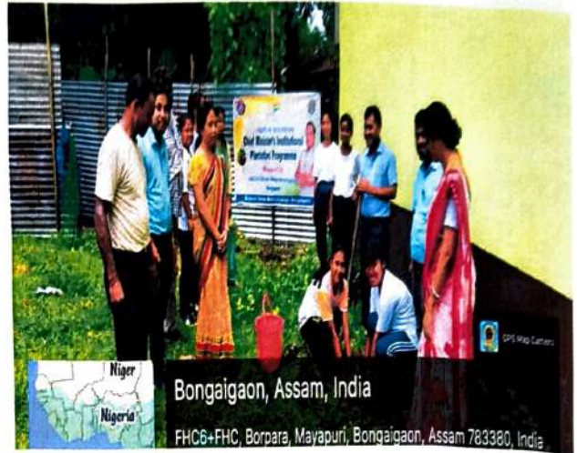
Bongaigaon, Assam, India

As a part of the Azadi Ka Amrit Mahotsav, the DSW of Gauhati University appealed the programme Officers of NSS to implement the Chief Minister's Institutional Plantation Programme on or before Independence Day i.e. 15 th August of 2022. The NSS unit responded to the appeal and planted few numbers of saplings in the college premises on 13 th August 2022. Altogether 22 volunteers and teachers took part in this programme.