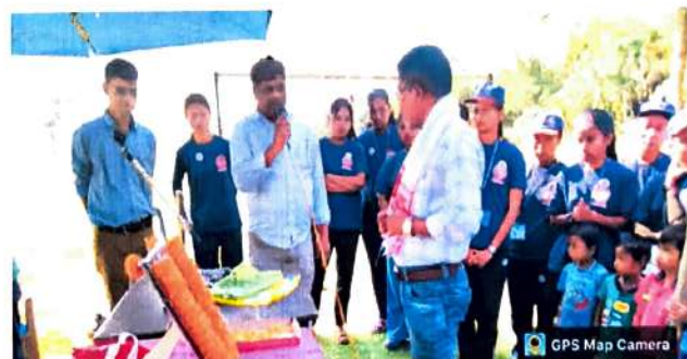
Sawnagaon, Assam, India Chengmari-Mulagaon Rd, Sawnagaon, Assam 783384, India Lat 26.423202° Long 90.498419° 14/11/22 10:13 AM GMT +05:30